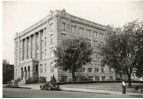
LAMAR COUNTY, TEXAS